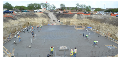
Basement slab concrete