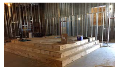
Baba altar build

*** Call 469-467-3388 or contact Temple volunteers for further info