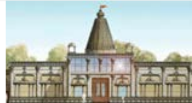
Indianization is not included in phase 1

Conceptual designs were developed by four architects and Temple selected one with optimal use of land. Temple contracted with KSD to provide Architectural services for the new Temple construction. Sachi Contractors were selected for providing General Contractor services for construction of new Temple and signed contract in Aug 2015. Sachi started mobilizing